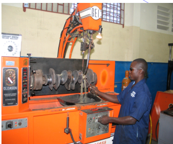
Controlled rebuilding of a crankshaft

This is state of the art submerged arc welding technology that uses an exclusive combination of unique welding materials and special application methods to fuse special alloys to the damaged journals.