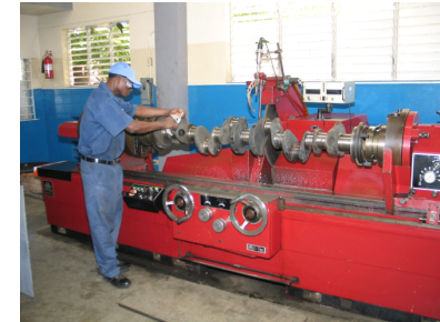
High-precision grinding of main and conrod journals