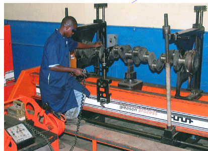
Accurate straightening of a crankshaft with compound bends

The process has the ability to deliver a perfect finish without pits and cracks for the crank radius journal and thrust areas.